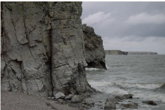
Dalai Lake Biosphere Reserve

Hay-Zama Lakes Wildland Park consists of numerous lakes and ponds separated by the banks of rivers that flow into and through the complex. The Hay River is the only stable water channel and the major outlet. Water levels fluctuate both seasonally and from year to year. During high-water years, the entire wetland is under water; during years when water levels are low, several shallow lakes are distinguishable, separated by extensive areas of emergent vegetation.